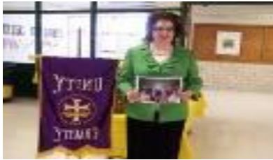
2014 EDUCATION CONTEST