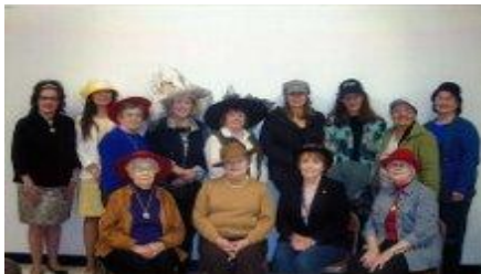
APRIL 2014 MEETING HAT THEME