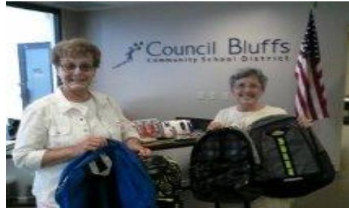
2014 CHARITABLE PROJECTS SHAR & PAM – SCHOOL SUPPLIES