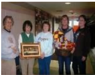
2014 LENTEN RAFFLE