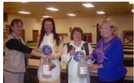
2014 LIFESAVER DRIVE